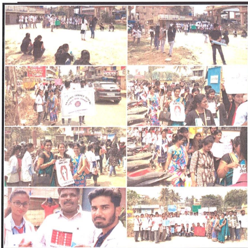
SURVEY ON TOBACCO CONSUMPTION

Conclusion: The students of Fourth Semester Bpharm conducted a survey on Tobacco consumption which was very informative for the students of the school.